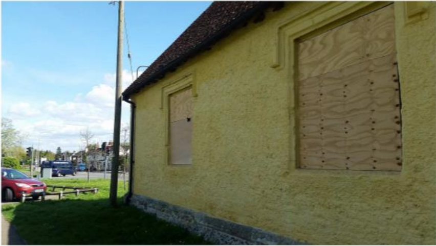
Current view of the north elevation, with the temporary wooden sheet protection.