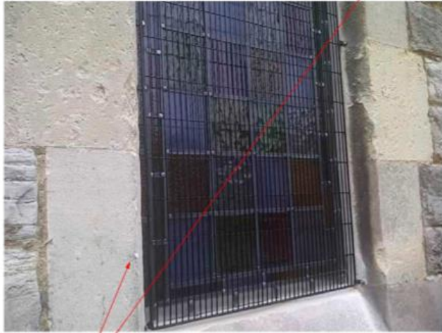
Two examples of typical mesh grilles on church buildings, and the discrete stainless steel fixings, which enable the mesh to be removed for window cleaning and maintenance.