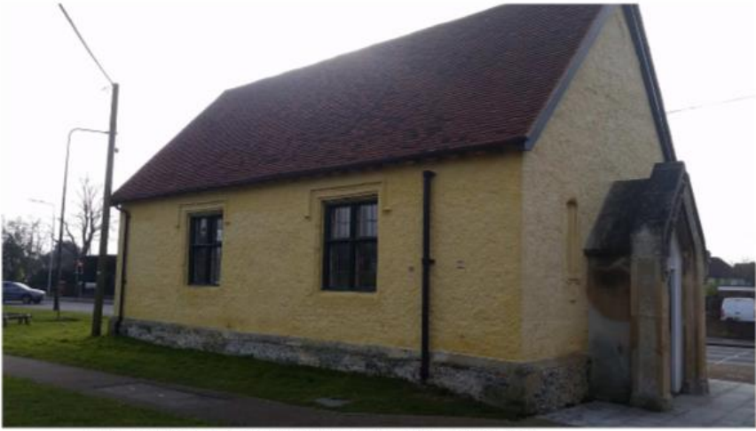
View of the north elevation without window protection.